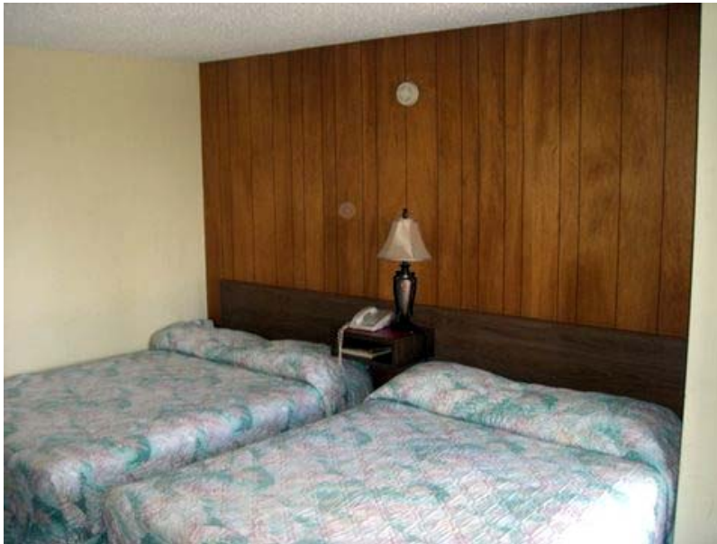
Typical Double Queen Room