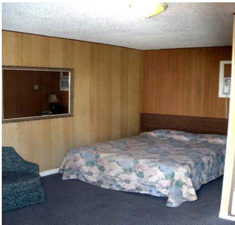
Typical Single Queen Room