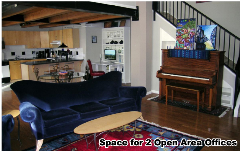
Space for 2 Open Area Offices